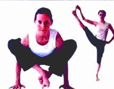
Yoga exercises have been patented in the west

These doctors are practitioners of ayurveda, unani and siddha, ancient Indian medical systems that date back thousands of years.