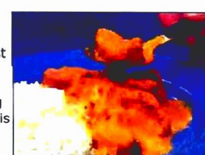
India got a patent on turmeric, used in curries, revoked

Last year, India won a 10-year-long battle at the European Patent Office against a patent granted on an anti-fungal product, derived from neem, by successfully arguing that the medicinal neem tree is part of traditional Indian knowledge.