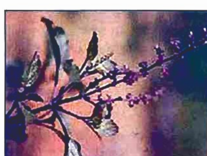
The tulsi (holy basil) plant has medicinal qualities

The electronic encyclopaedia, which will be made available next year, will contain information on the traditional medicines, including exhaustive references, photographs of the plants and scans from the original texts.